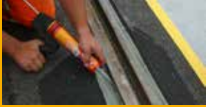
SEALING AND BONDING