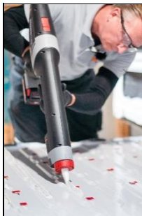
Application of Sikaflex®-554 PowerCure