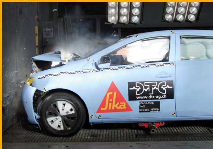
WITH SIKA YOU ARE ON THE HIGH ROAD TO SAFETY.

SikaTack® DRIVE is compatible with both installation processes offered by Sika. The Black-Primerless delivers the fastest application process for the standard auto glass related applications whereas using the All-Black solution lets you keep inventories smaller by just using one Pre-Treatment product for all process steps.